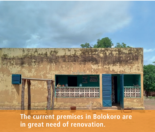
The current premises in Bolokoro are in great need of renovation.