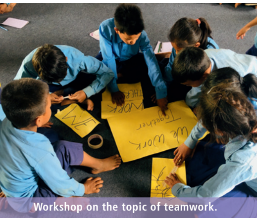
Workshop on the topic of teamwork.